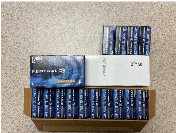
Lot #7 Federal Premium Power Shok Buckshot 12 Gauge Shotshells (125 Rounds) $75 Minimum Bid