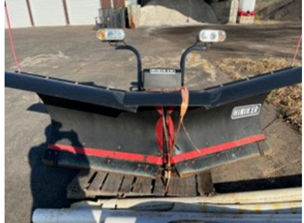
Lot #6 Totaled snowplow, multiple broken welds and bent material No Reserve